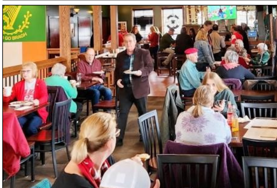
Members enjoy lunch at last year's rugby watch party

Funds raised at the festival will go to the General Fund of the St. David's Society to offset expenses.