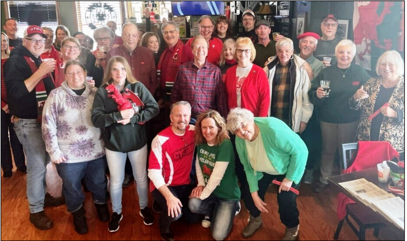
Members and friends of the St. David's Society enjoy an afternoon of Welsh rugby

A good time was had by all at the annual rugby watch party on Saturday, March 18th at the Celtic Harp in Utica, to watch Wales play France in the Six Nations Championship.